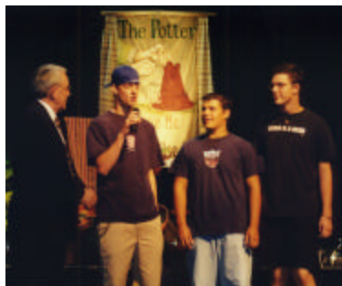
... Youth share what God did in their lives during the conference